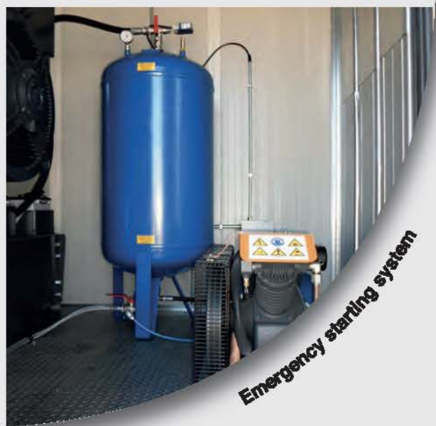
Emergency starting system