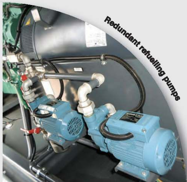
Redundant refuelling pumps