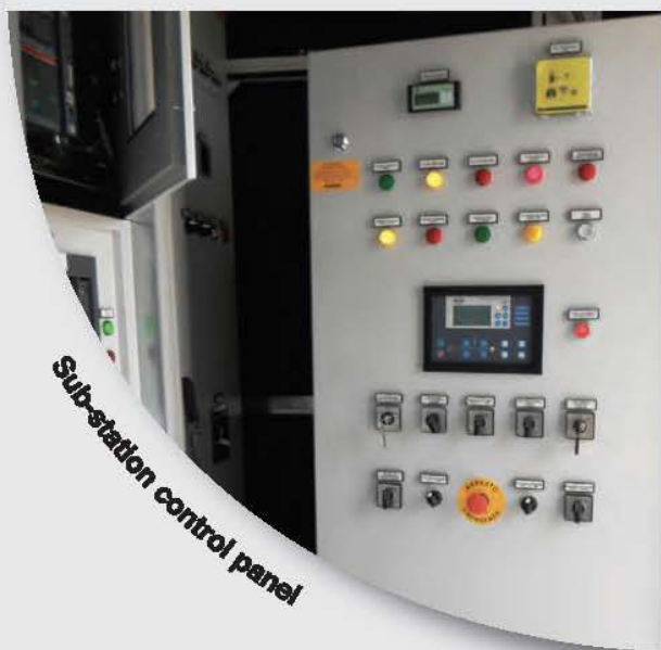
Sub-station control panel