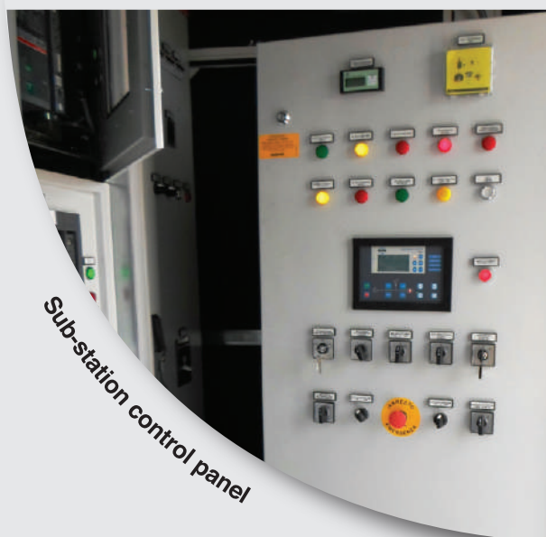
Sub-station control panel