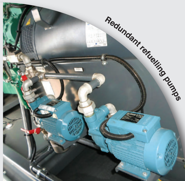
Redundant refuelling pumps