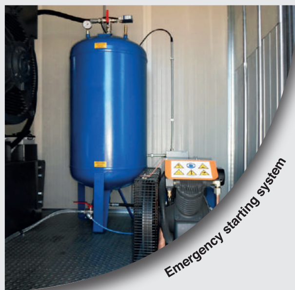
Emergency starting system